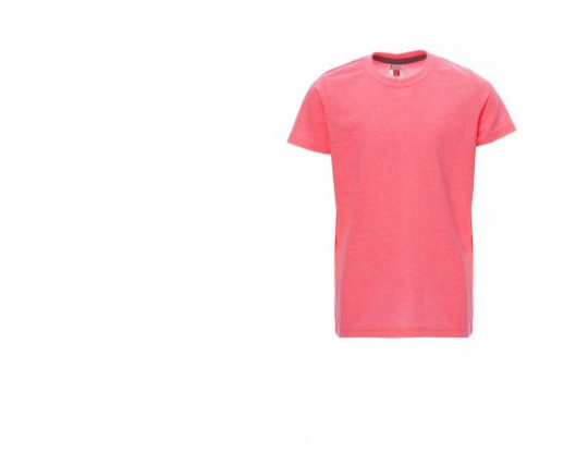
FLUORESCENT FUCHSIA 05003

COMPOSITION: 65% POLYESTER + 35% COTTON APPEARANCE: JERSEY WITH 65%POLYESTERE WEIGHT: 155 GR/MQ SIZES: 5/6-7/8-9/10-11/12-13/14 PACK: 5/100 HS CODE: 61099020 MADE IN: BD